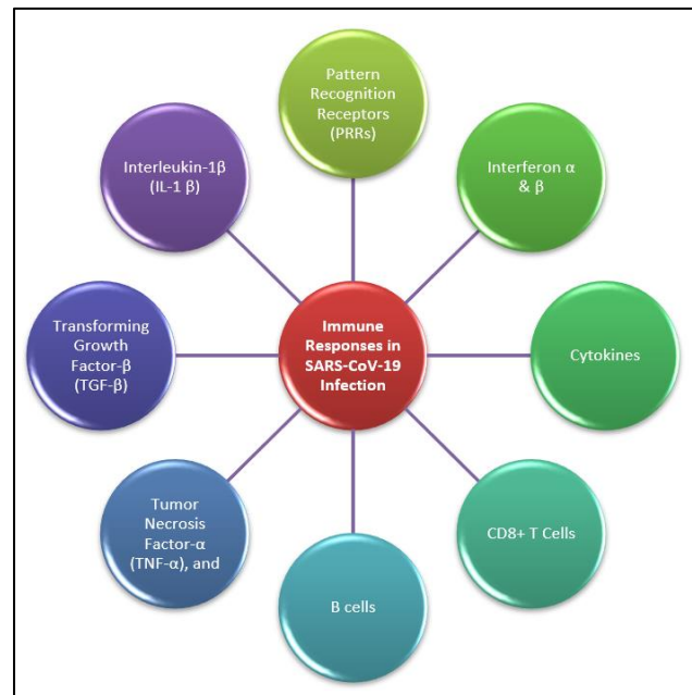
Fig. 1: Immune responses to SARS-CoV-2 infection

renders these neighboring cells less susceptible to viral replication and spread. 14